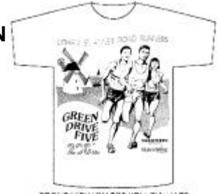
Souvenir coloured t-shirt for every finisher

"Very few races manage to mix such fantastic organisation with a real feel good factor from start to finish."